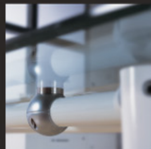
The sphere and round supports are the extensions of points and lines...