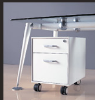
Movable pedestal leaves more space.