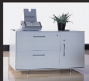
Side cabinet is artistic with practicality.